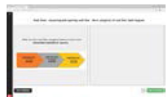
4. Label diagram