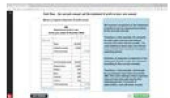
2. Core concept