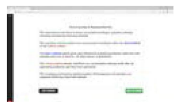
5. Key term