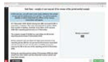
3. Worked example